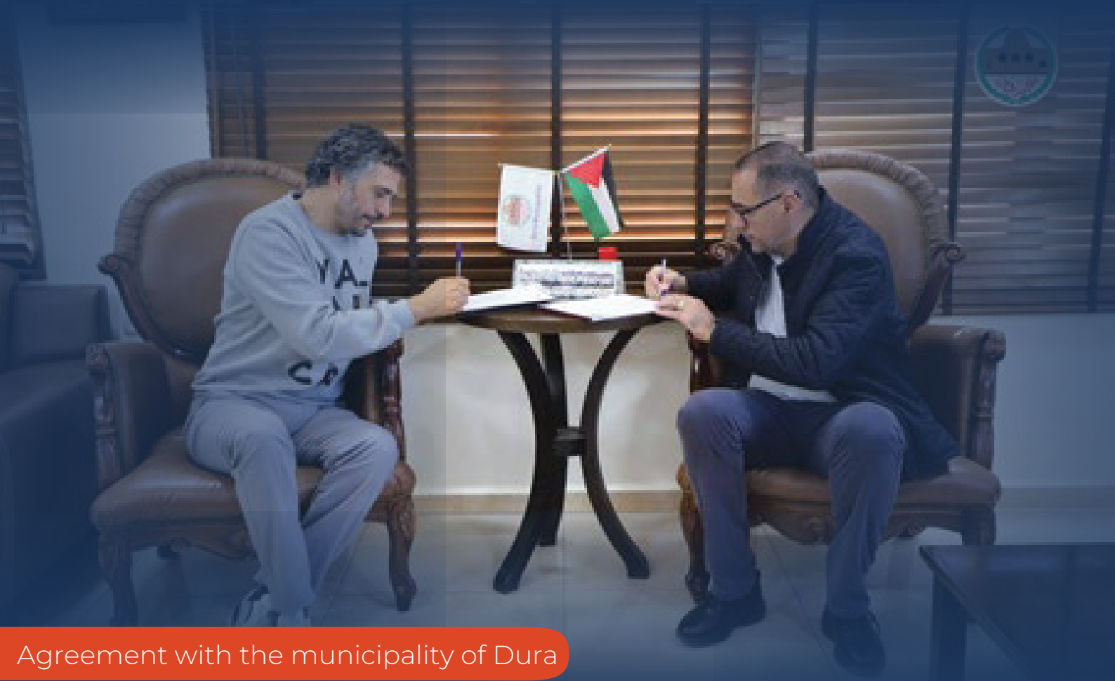
Agreement with the municipality of Dura