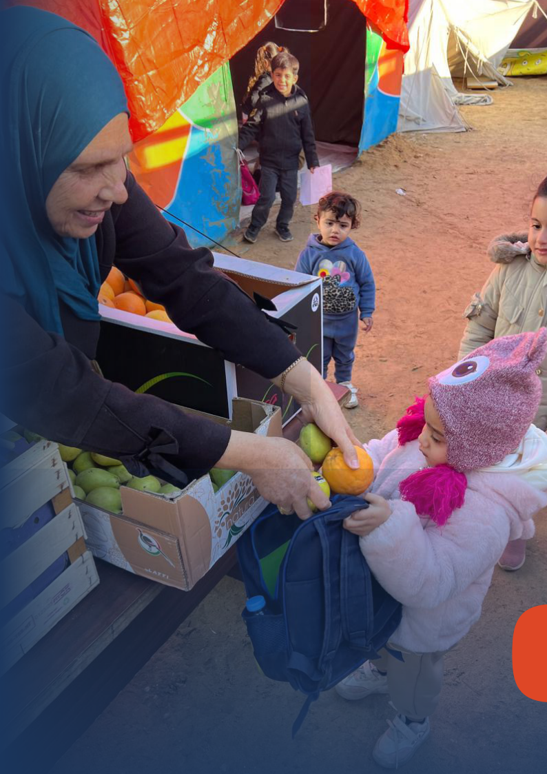
Distribution of fruit to students at the emergency Habiba School in Gaza.