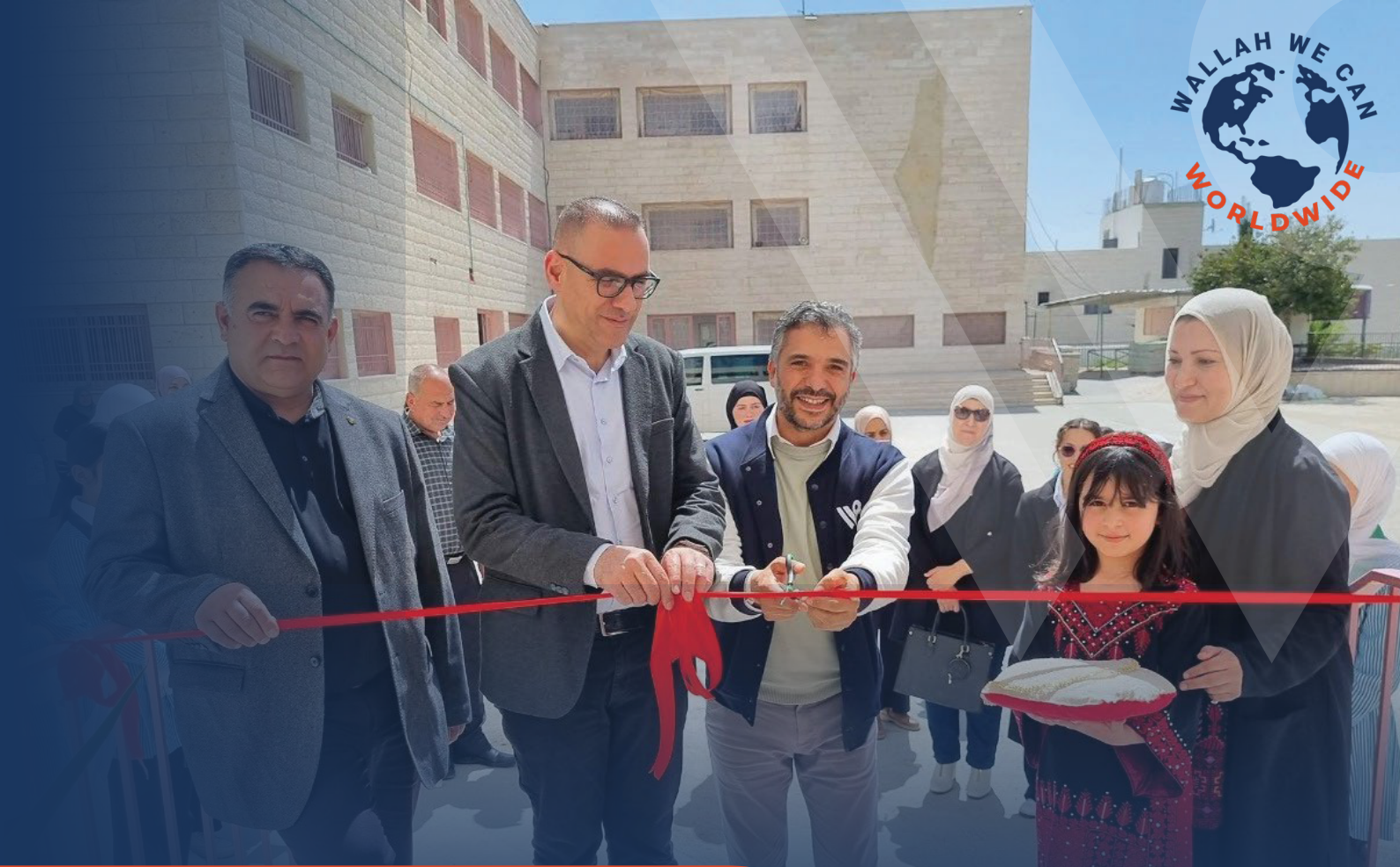
Inauguration of the "Palestine" school in Dura