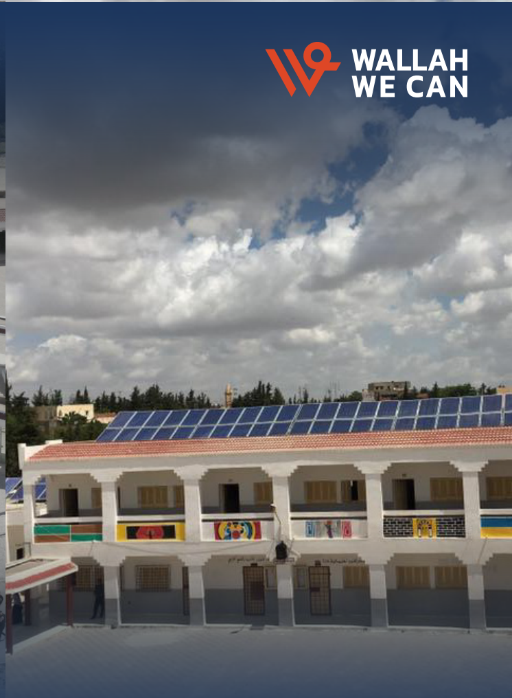
GreenSchool of Makthar