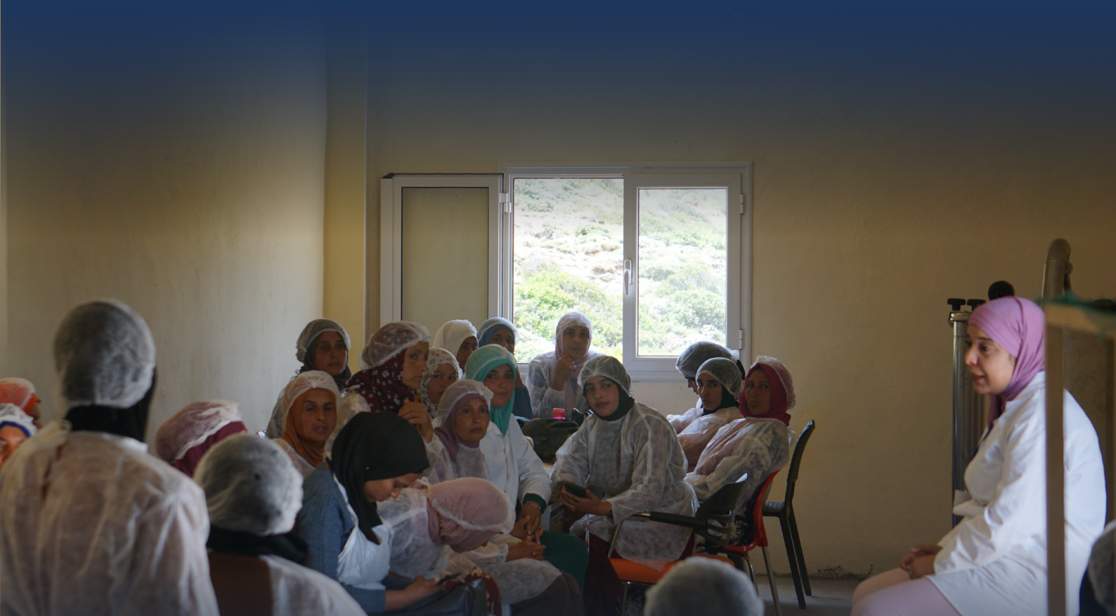
Training of parents at our training center in Sidi Mechreg.