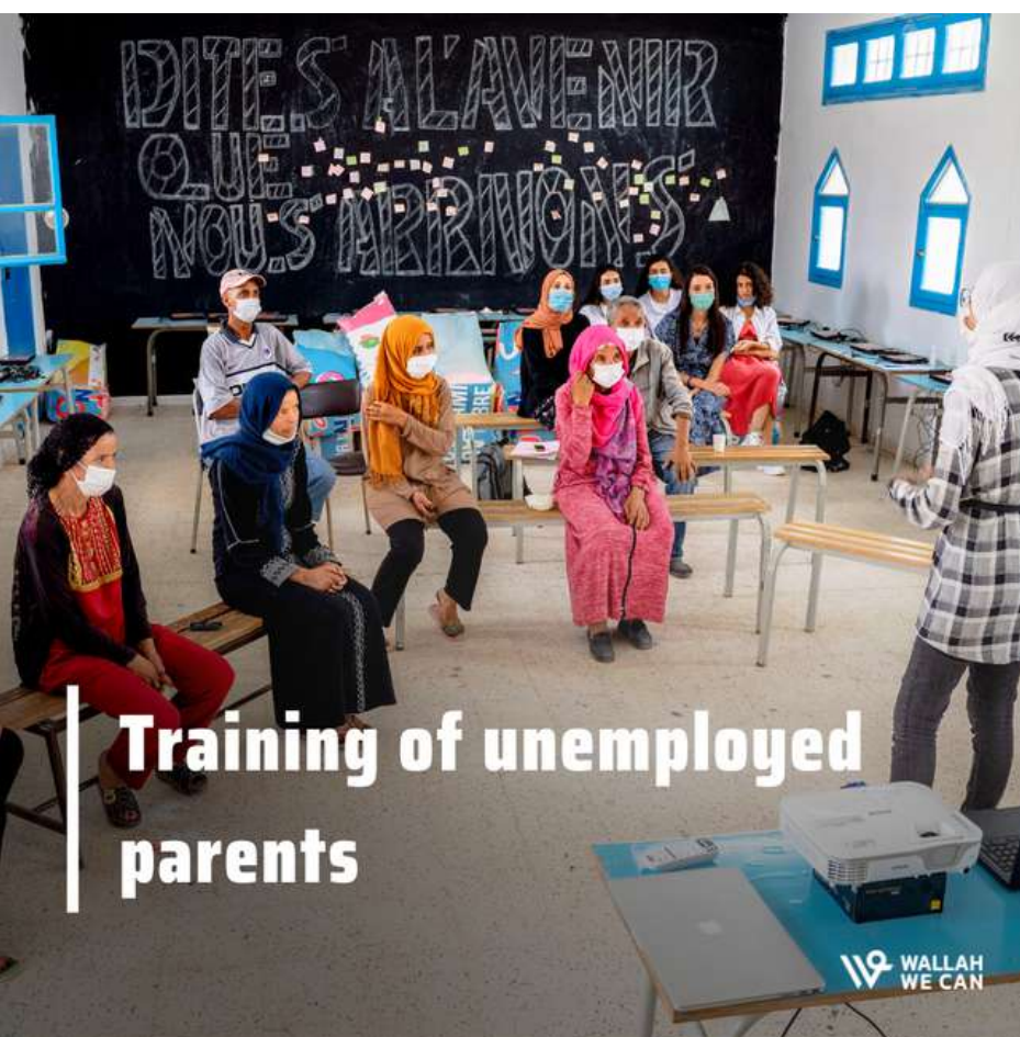
Training of unemployed parents