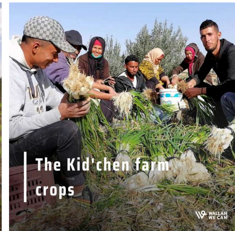
The Kid'chen farm crops

GreenSchool perfectly meets the sustainable development goals