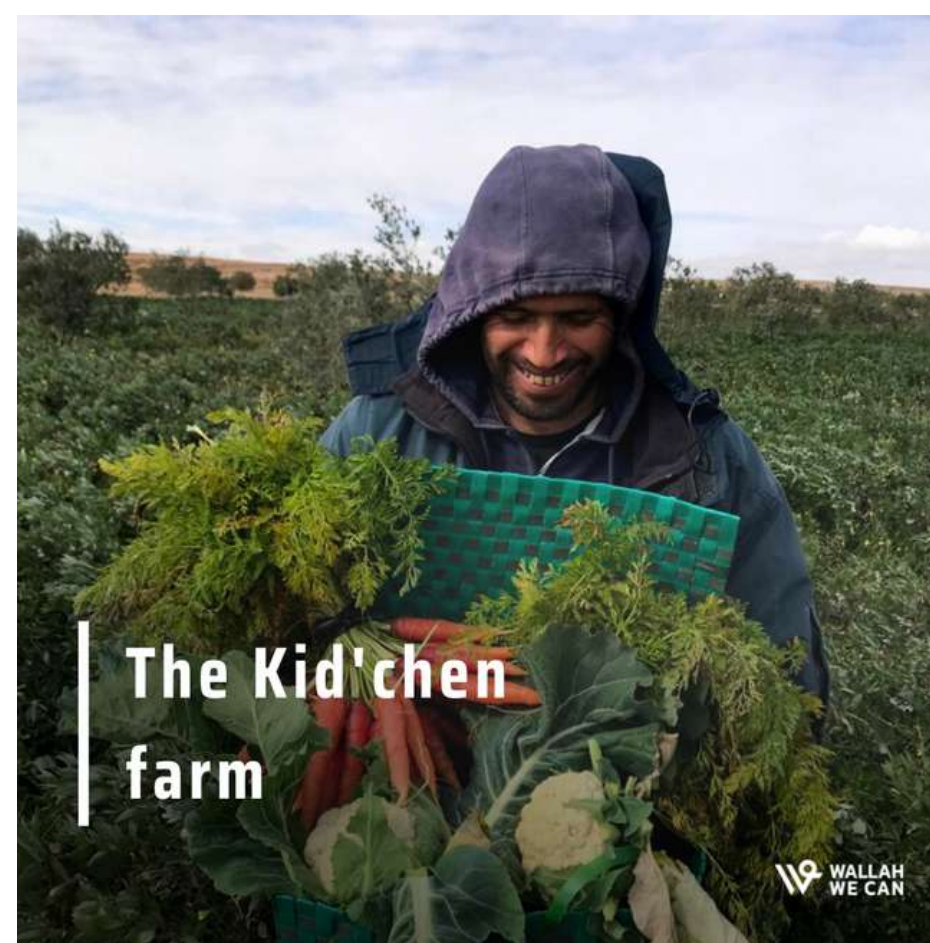
The Kid'chen farm